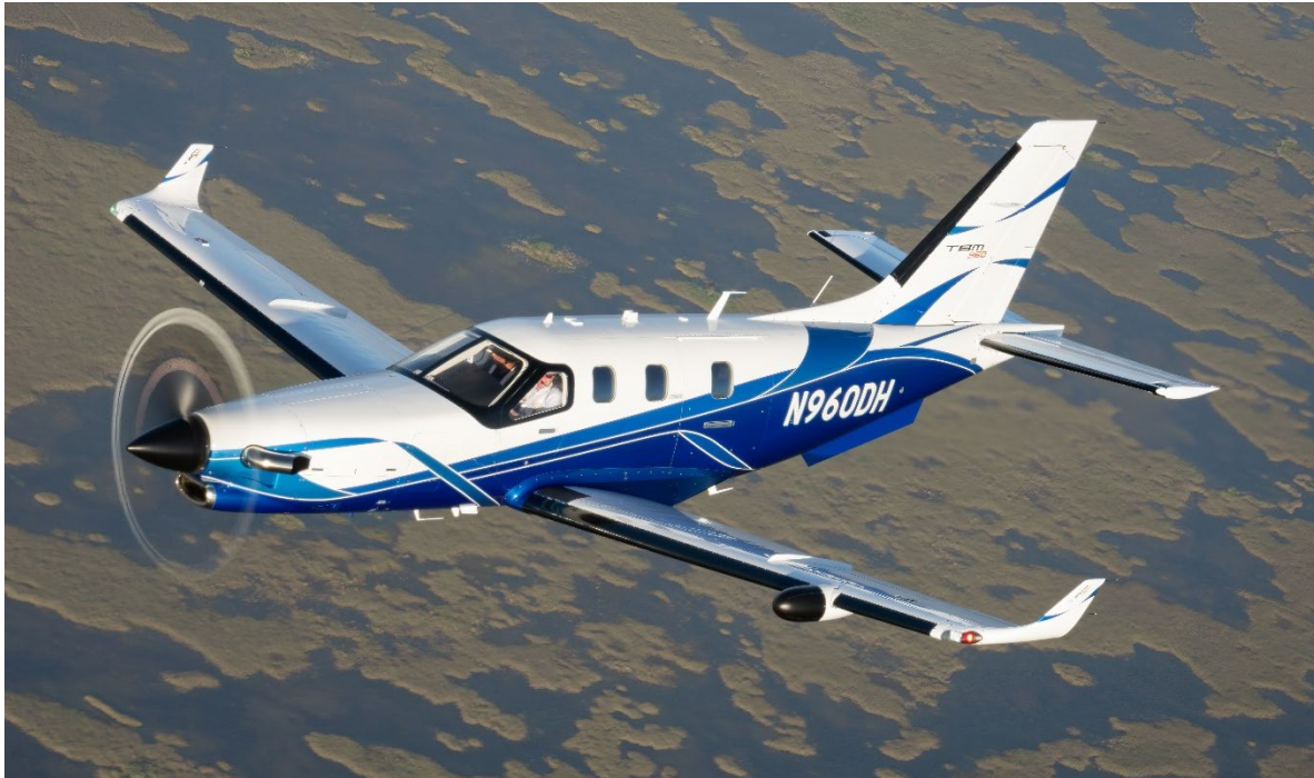
TBM 960 Model Year 2023